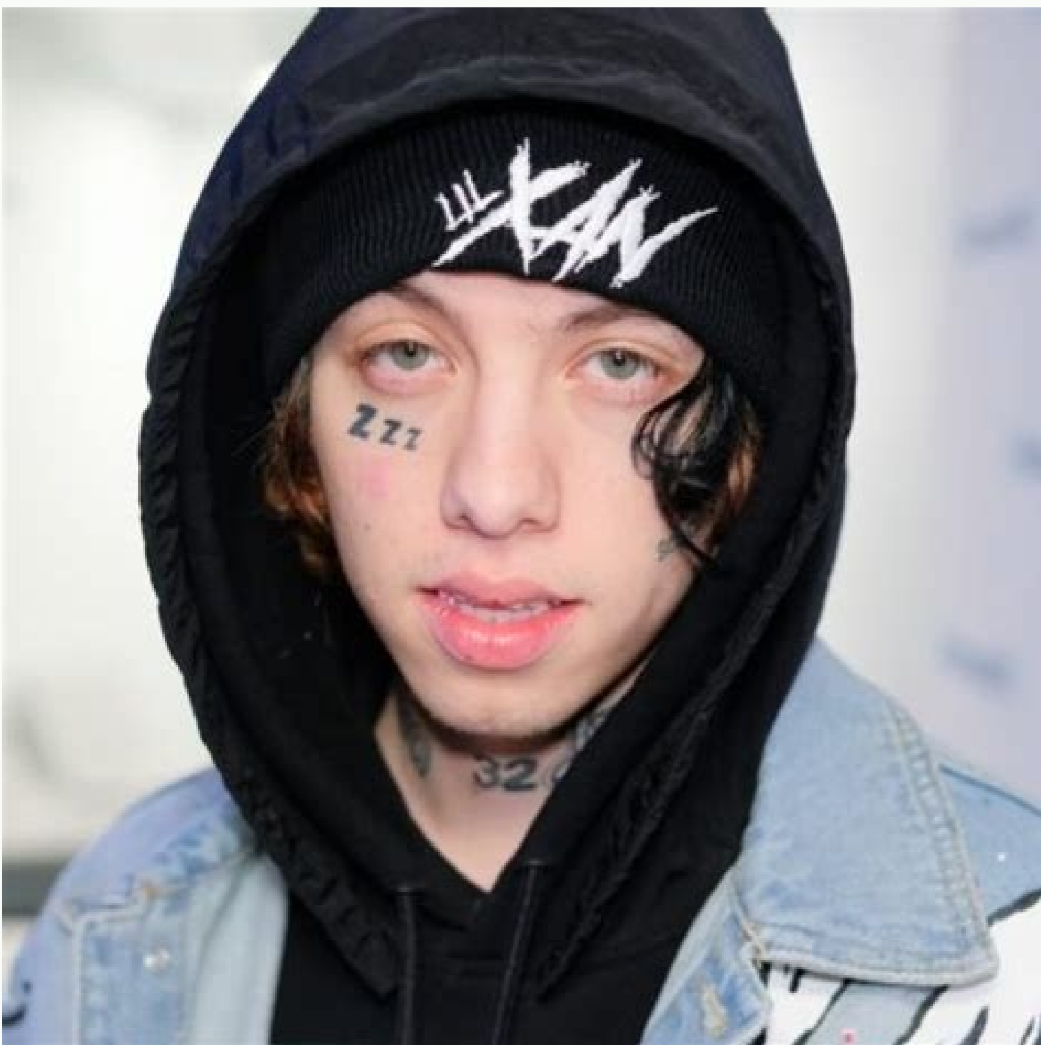
Lil xan betrayed lyrics meaning. Betrayed (lil xan song). Betrayed lil xan meaning. What song made lil xan famous. Lil xan song betrayed lyrics. Songs like betrayed lil xan.